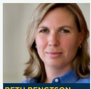
Principal HALE ADVISORS