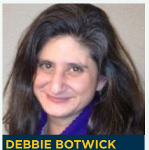
Colleague Capability Lead Enterprise Multi-Channel Marketing, PFIZER