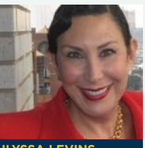
Founder/President CENTER FOR COMMUNICATION COMPLIANCE